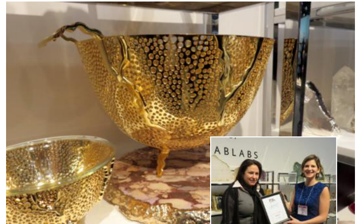
Table Top Winner – New York