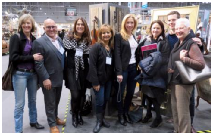
... and on the job at NY Now.