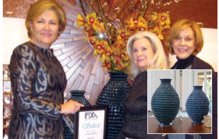
Table Top Winner – Las Vegas

Tabletop - Pinecone Vase from Global Views, Judge Karen C. Wirrig, FIFDA, Karen Cole Designs: "The genius of the human hand is easily seen and felt in this hand-thrown Italian ceramic, multi-dimensional glazed pot with color that seems to glow from within. The textural pattern of the seeds is hand-applied creating the stylized pinecone details."