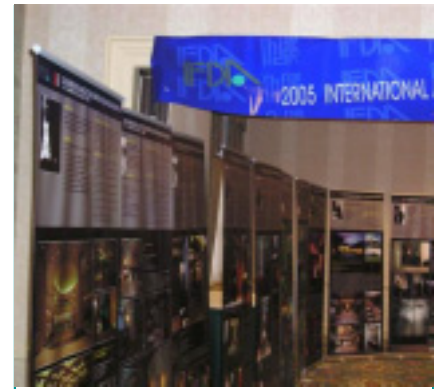
Exhibition of IFDA China Chapter Architecture and Interior Design projects