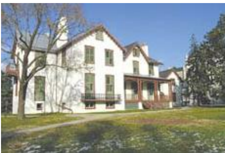
The Lincoln Cottage

Not so, public morale. "The Habaneros are a strikingly handsome people...well dressed, in great shape, and children are filled with song and laughter," she reports. "Above all, they are courteous, helpful (many speak English and are very well-educated). And nary an armed police person was to be seen."