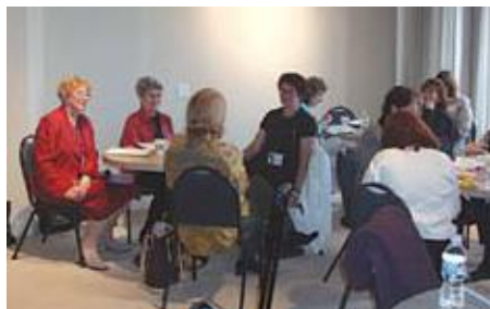
Northern California Chapter Student Career Forum

Our PR team has been doing an incredible job of getting out before and after notices that have given us national exposure in the trade journals as well as mentions in national shelter publications this past year. The Power of the Press is showing, and so is the POWER OF IFDA!