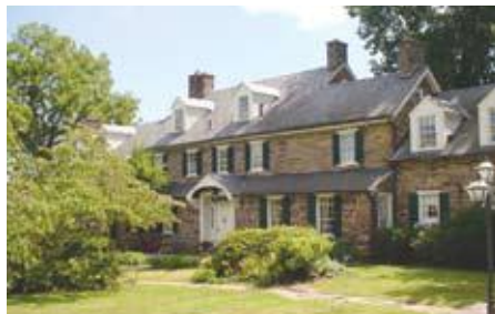
The Pearl S. Buck House

The Philadelphia Chapter board was recently presented with certificates of appreciation at our Pearl Buck House holiday event.