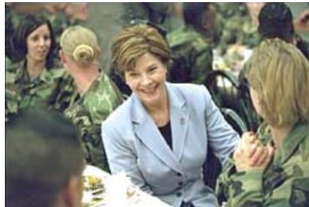
First Lady Laura Bush