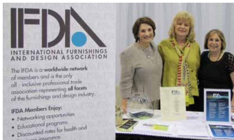
Left Photo: IFDA So CAL Booth at Vision '11

We met many attendees at the show who were interested in learning more about and joining IFDA. There were also a few people who are interested in starting chapters in their areas.