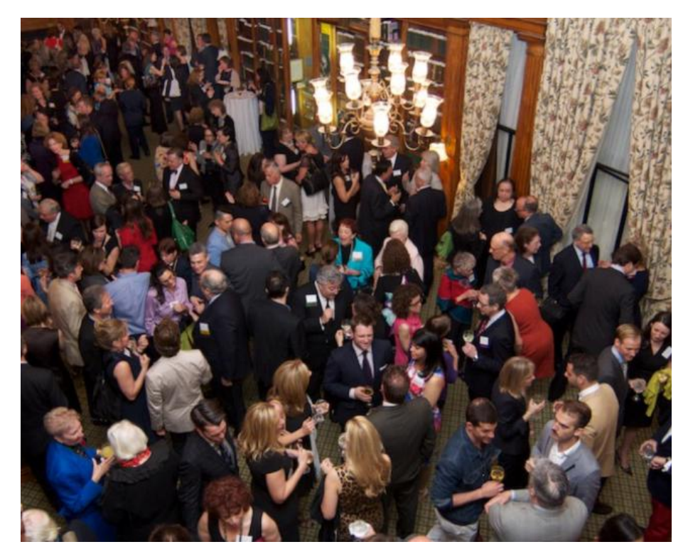
The capacity crowd during cocktails at the COE 2012