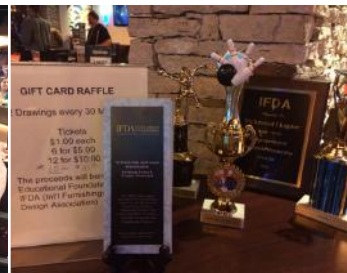
Trophies were awarded for highest score, most strikes, and most gutter balls. Donated raffle prizes were money-makers and, combined with team fees to play, contributed hundreds of dollars for the IFDA Educational Foundation.