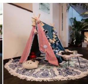
Gingham and denim are perfect fabric choices for the forest scene.