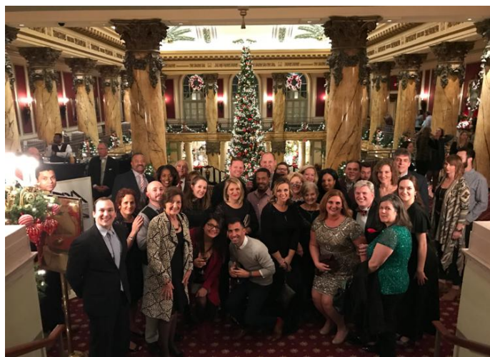
The venue for the annual event was the very grand Jefferson Hotel— a Richmond highlight for tourists and residents alike during the Christmas Season. The IFDA party was held on a special balcony overlooking the elaborately decorated lobby and stunning 31 foot tree.

Richmond Chapter members and guests gathered for a festive evening topping off a year of informative programs, monthly Design Chats, and record-breaking chapter growth.