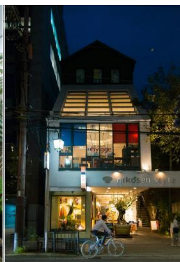
A passing cyclist catches a glimpse of the enchanted forest inside, created by IFDA Japan at Machi Decor.