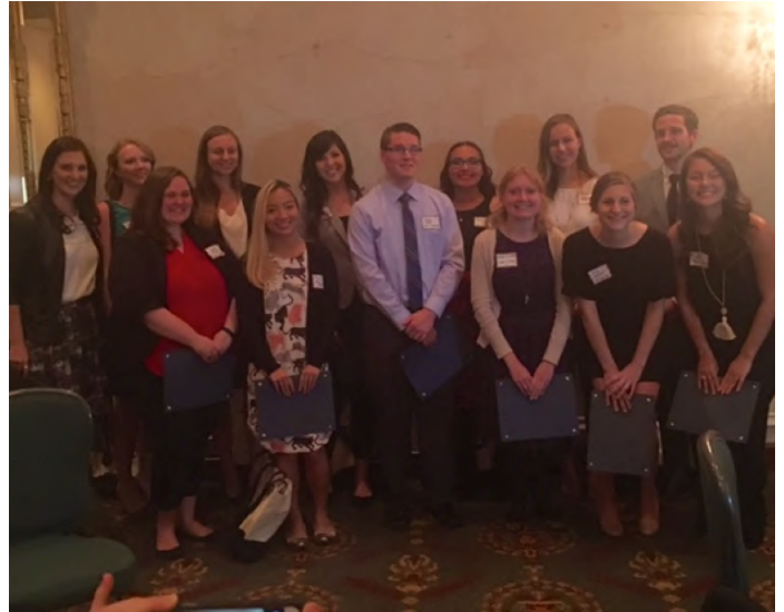
Thirteen students from 13 colleges and universities were honored.

Thayer Coggin furniture is proudly handcrafted locally in High Point, North Carolina. All their upholstered furniture is custom made to order by our master craftspeople. They offer hundreds of fabric choices in a variety of colors, patterns and materials, and gladly accept client supplied fabrics. Many of their products are available in a variety of wood and metal finishes.