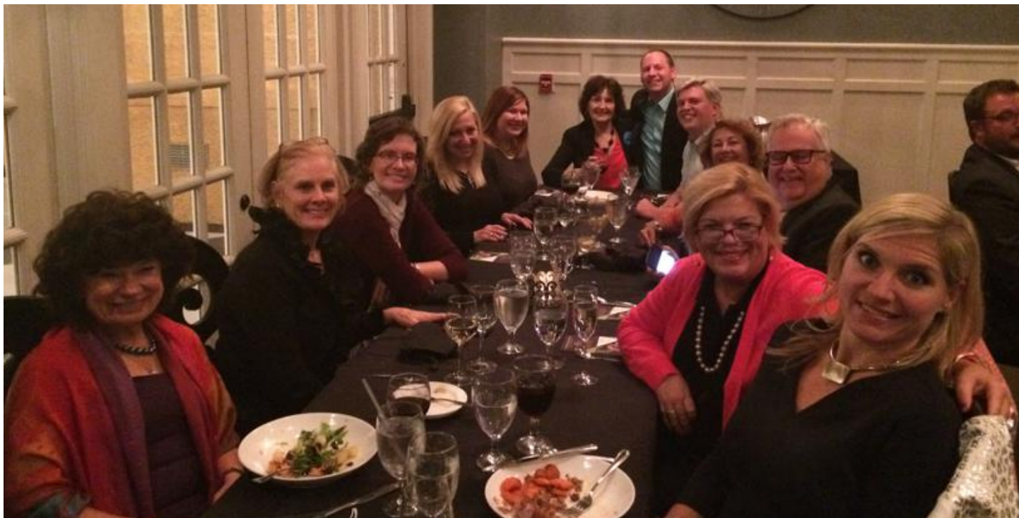
Members of the Philadelphia Chapter, the Carolinas Chapter and Richmond Chapter gathered for dinner at a favorite market restaurant, The Adams Inn.