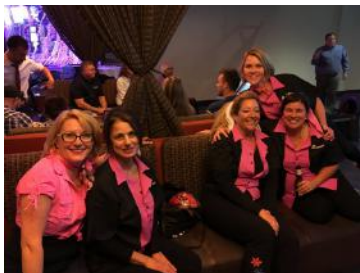
Members organized their teams and some even adopted team outfits for the evening.

This year's event raised $1000 for The Educational Foundation ... the most successful EF Fundraiser to date by the Richmond Chapter.