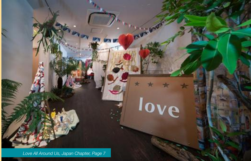
Love All Around Us, Japan Chapter, Page 7