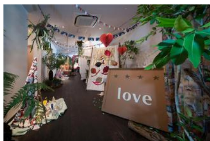
Love all around us...IFDA Japan presents ten tent displays for Machi Décor