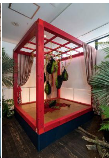
This framed-out platform tree-house was a big hit with visitors.