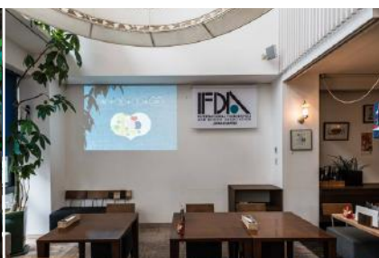
Guests lunched and learned in the proudly signed study center at Machi Décor.