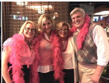
The Annual IFDA RVA Bowl-A-Thon was themed "The Fifties" so the members came dressed in true retro-fashion.