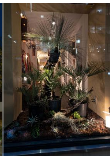
Exotic plants landscape the IFDA forest, thanks to Mr. Mataemon of Rose Garden Plants, who searches the world for unusual botanicals.